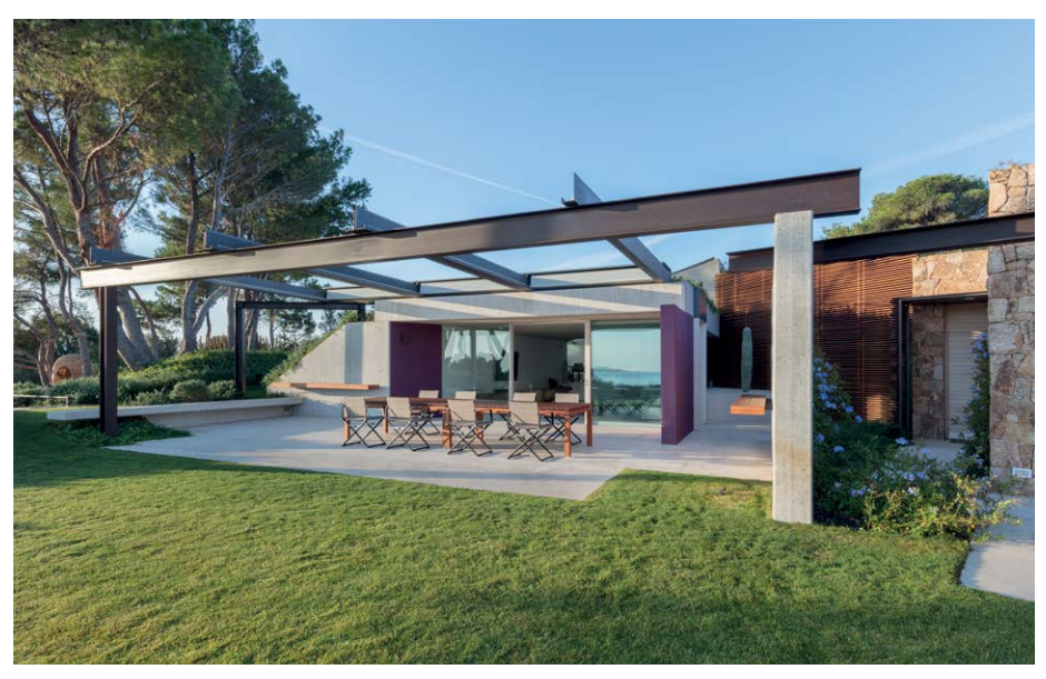
The piazetta at Villa 2, which contains guest bedrooms as well as a spa and swimming pool, features basalt flooring by F.lli Catella and iroko wood deck and façade cladding by Lualdi