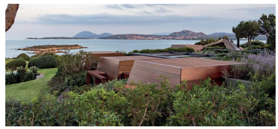
Villa 1 seen from above; in the foreground are the three iroko covered towers of the bedrooms

by about 70 per cent, making the villas, technologically updated and totally revamped from the mechanical point of view, upgraded to class A status. The task was facilitated by their architectural characteristics: the semi-hypogean volumes and the mass exposed inside favour the natural bioclimatic behaviour of the buildings, reducing their energy requirements. \boldsymbol{P}