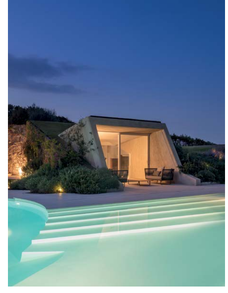
The clean, geometric lines of the architecture are echoed in the dining area of Villa 3, with a La Punt table from Fiorini designed by act_romegialli, Seax chairs by Dedon and Paola Lenti cushions designed specifically for Fagnola and PAT